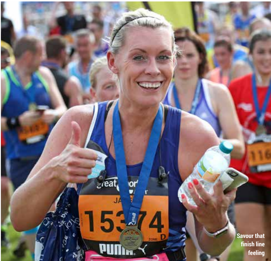
Savour that finish line feeling

The family reunion area is located at the