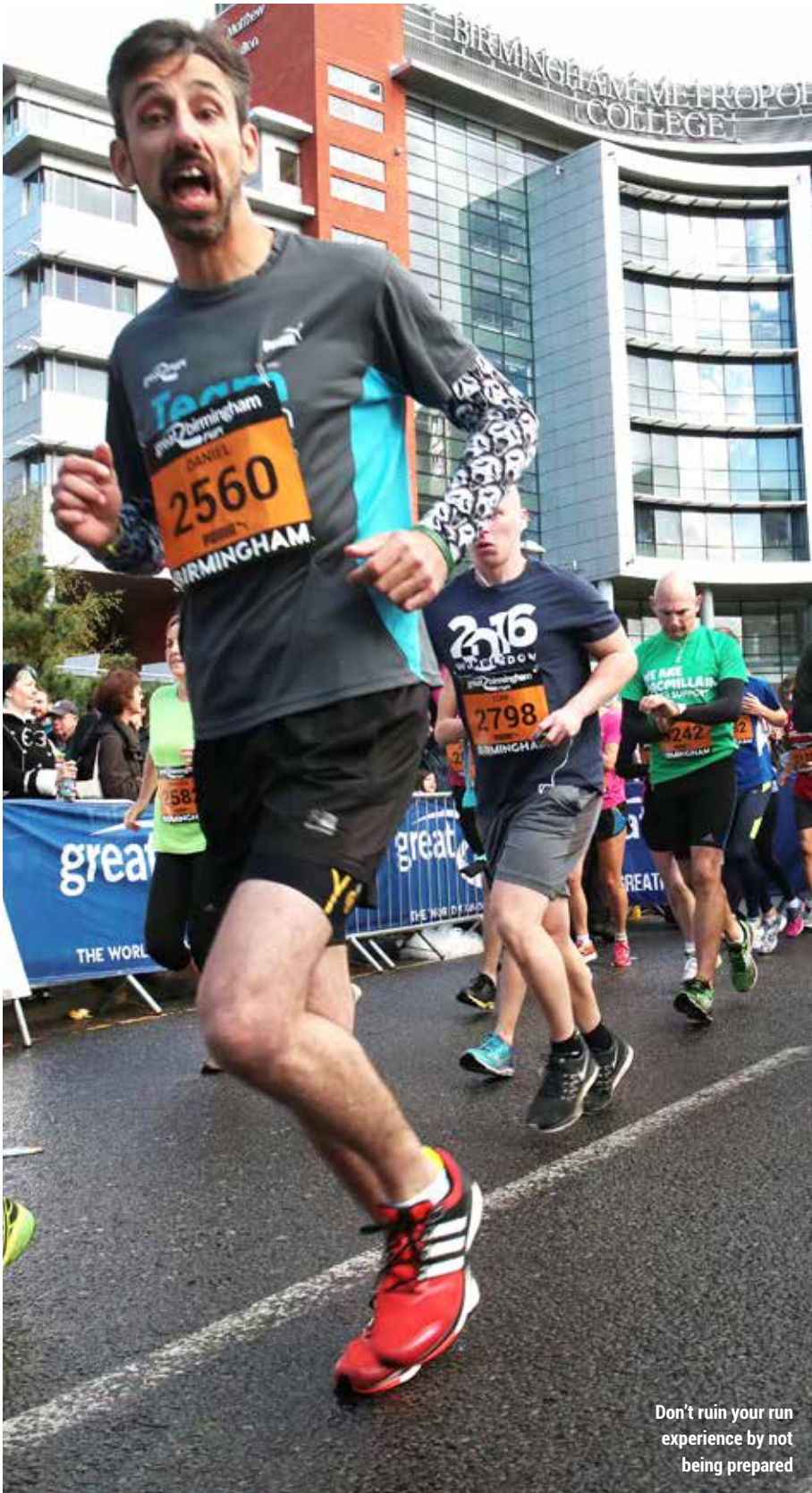
Don't ruin your run experience by not being prepared